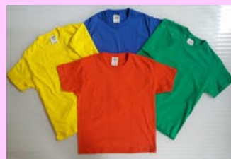
House Team List on the last page.

This year your child/ren are needing a change of P.E uniform when they are playing outside for sports and during the After School Programmes. Your child has been allocated a House Team (view list on newsletter) to what plain coloured t-shirt you would need to purchase from any local Kmart, Warehouse, or any local store. It is important that the children do have a change of clothing for hygiene purposes. Thank you